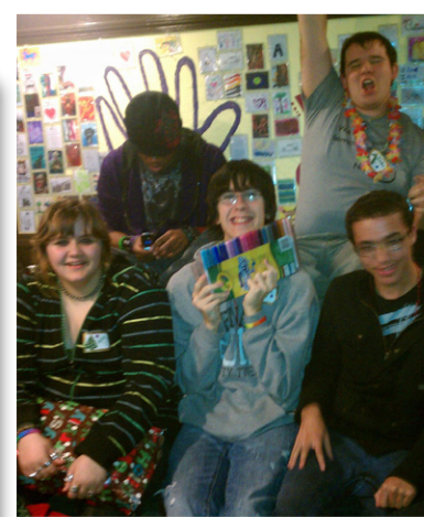
Youth from IYG were grateful for all the gifts you provided.