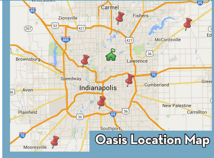
Oasis Location Map

Return this form in the offering or in the basket at the info kiosk.