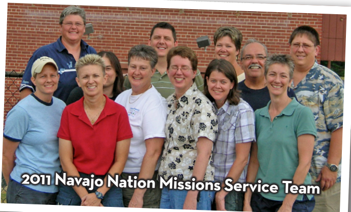
2011 Navajo Nation Missions Service Team

Financial Peace University will be offered at the church beginning October 2. There will be preview sessions offered today and next Sunday after each service. Join us in Room 4 (down the west hallway) immediately after service today. More details about the class are on the Weekly News insert. This course can radically change the way you look at money, generosity, and your finances.